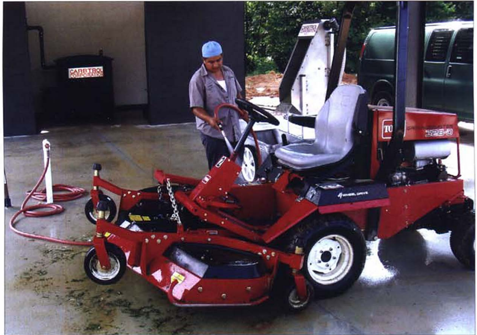
An installed system.

Real and perceived risks to local and regional water supply are triggering regulato-